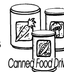
Canned Food Drive

Please remember our less fortunate brothers and sisters this Christmas with donations for the Food Banks